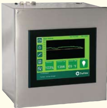
Truflow Control Panel

TruFlow monitors ventilation system efficiency relative to your utility costs, in real-time, so that you can manage your kitchen to take advantage of off peak times by turning down appliances. Setting an energy reduction goal reduces your utility costs even more!