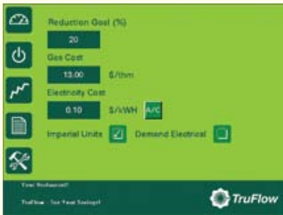
Energy Reduction Goal helps to maximize savings!